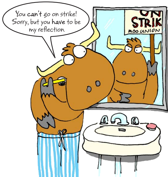
MOORICE'S MORNING MINISTRATIONS

"our" in "Let us make man in our image, after our likeness"? Does that mean there's more than one God? Nope. In Bible times, people traditionally wrote "us," "we," and "our" as a way to show respect for authority. In this passage from Genesis, the plural form was used to show respect for God. Government officials, kings, priests, and other powerful people also referred to themselves this way.